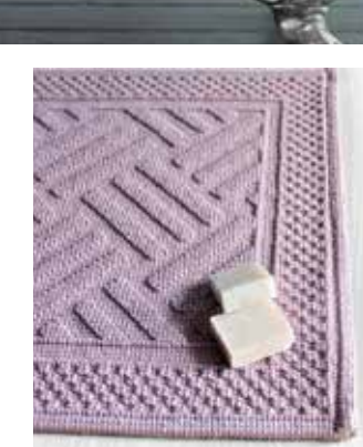
Sierra Cotton Bath Mat