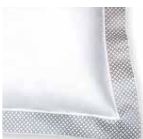
Madison 550 Thread Sateen