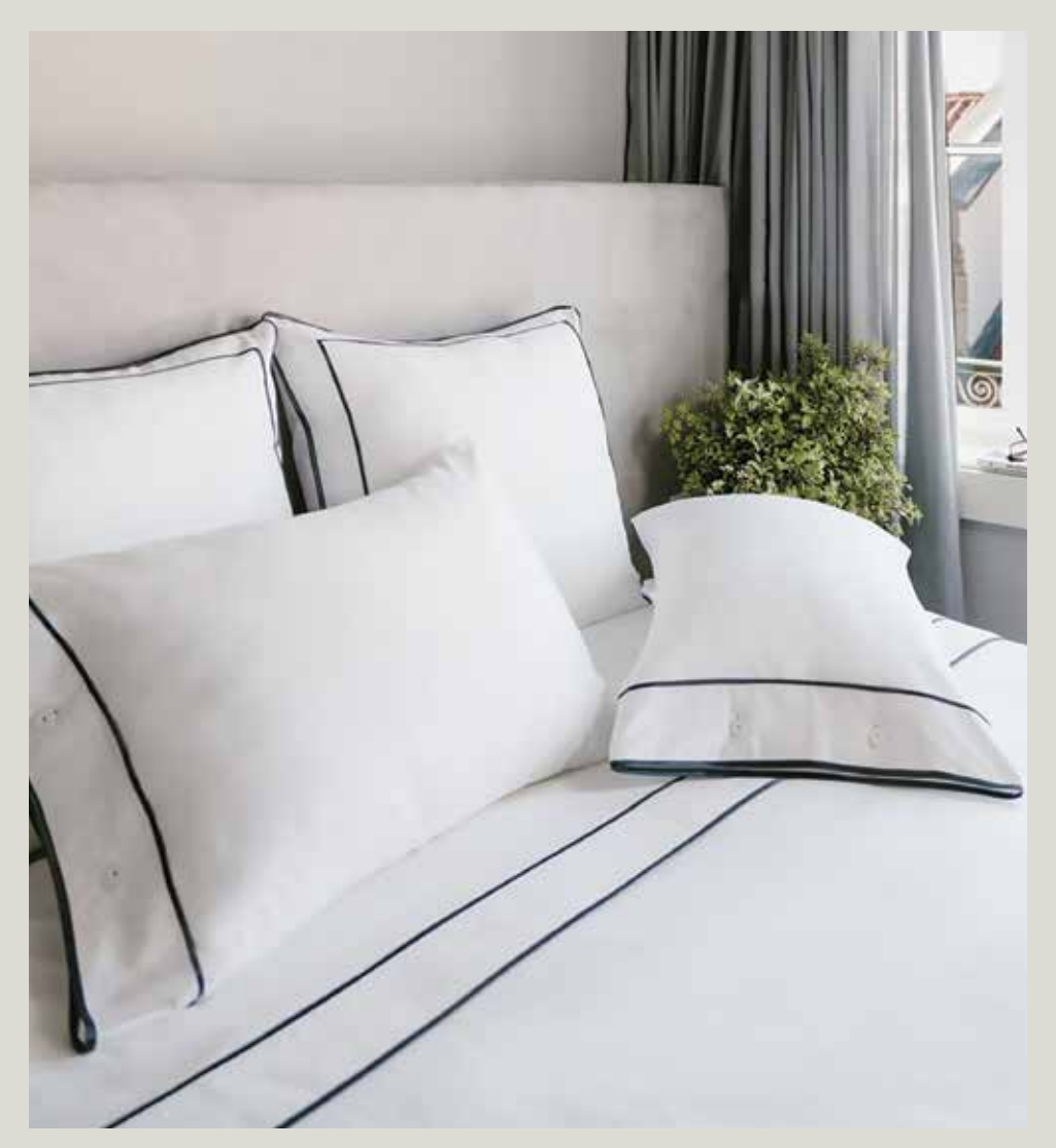
LONDON · PARIS · BRUSSELS · NICE · MARBELLA