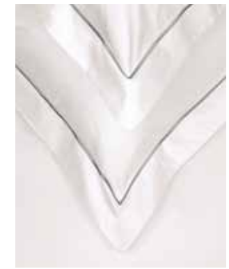
FLAT SHEETS Single

Our standard fitted sheets are 12 inches deep (30cm). Extra deep fitted sheets are also available, they are 16 inches deep (42cm).